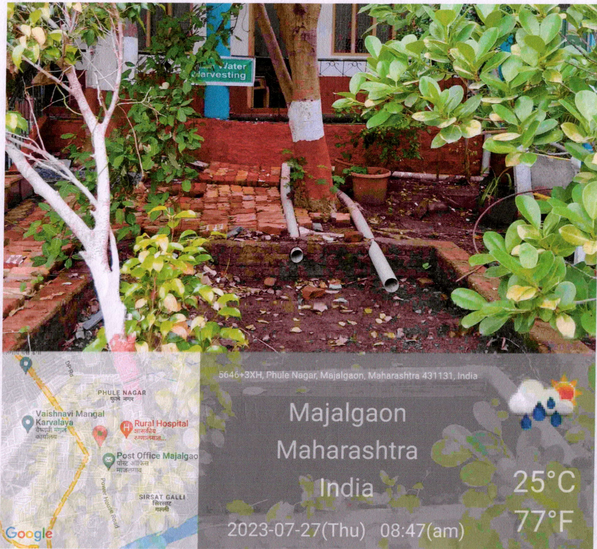
Water Harvesting System in College.